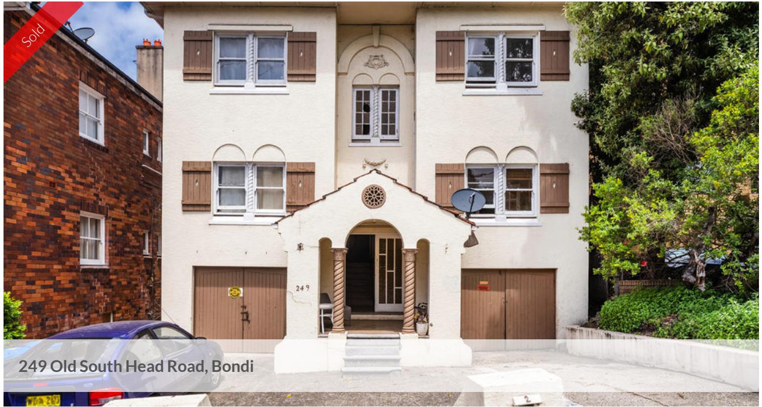
249 Old South Head Road, Bondi