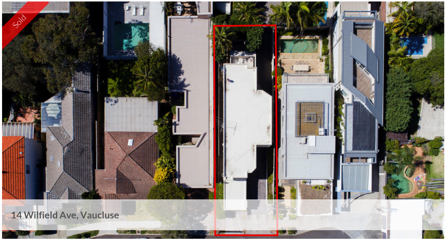
14 Wilfield Ave, Vacluse