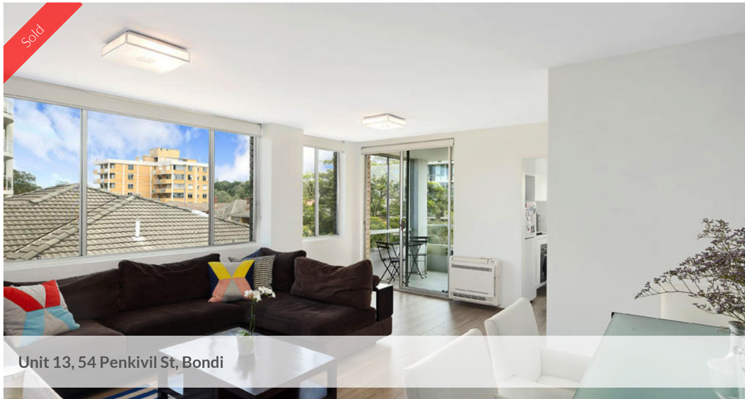
Unit 13, 54 Penkivil St, Bondi