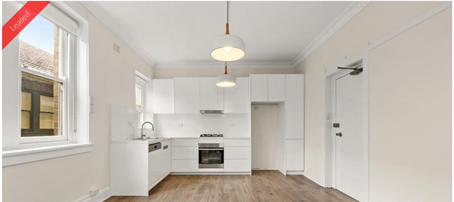
Unit 14, 530 New South Head Rd, Double Bay