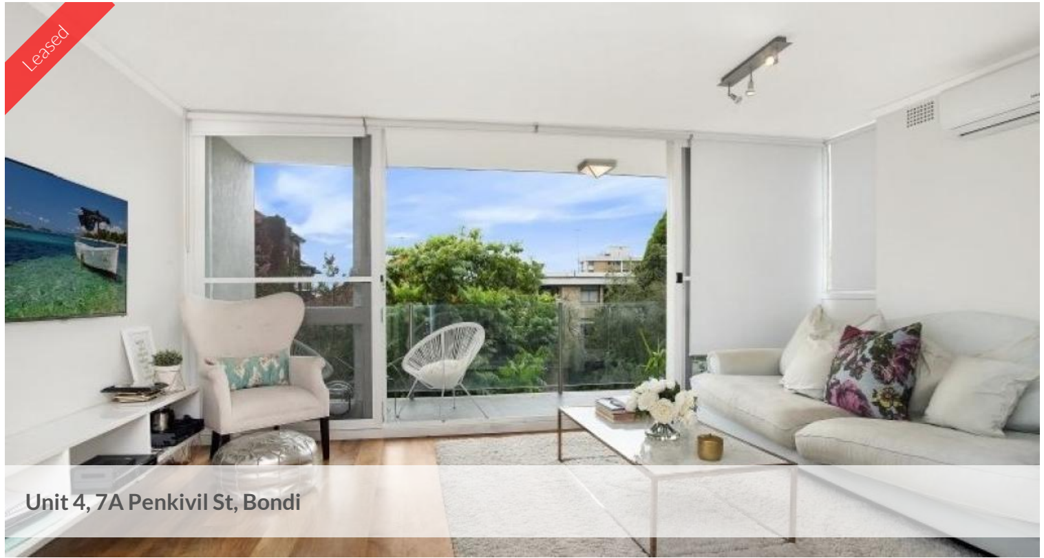
Unit 4, 7A Penkivil St, Bondi